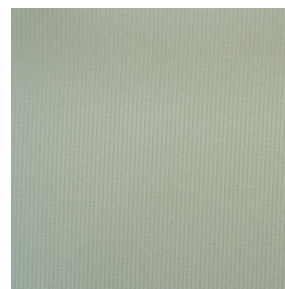
3141 ALPHA Mousse 92