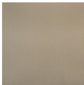
3141 ALPHA Beige 63