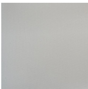
3141 ALPHA Gris 97