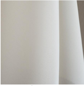
3141 Champagne 02