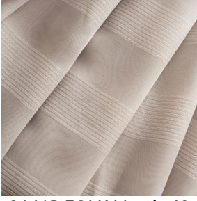
3141R FOLK Mastic 48