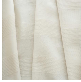
3141R FOLK Nacre 203