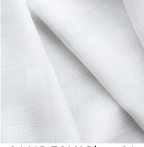
3141R FOLK Blanc 01