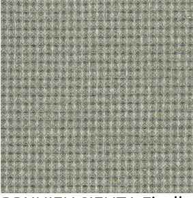
BRUNIEN SIENTA Ficelle 09