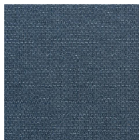
COMET OSIER 2300 Minéral 157