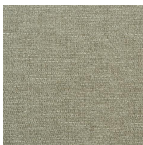
COMET OSIER 2300 Lin 11