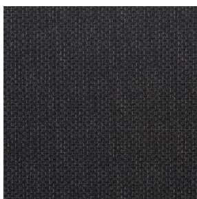
COMET OSIER 2300 Truffe 189