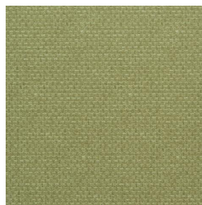
COMET OSIER 2300 Bergamotte 121