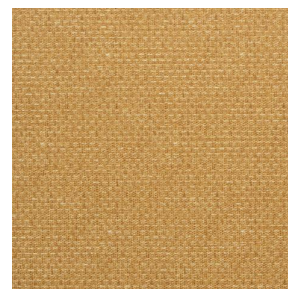
COMET OSIER 2300 Miel 17