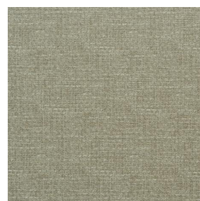
COMET OSIER 2300 Lin 11