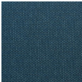
COMET OSIER 2300 Tempête 179