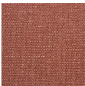
COMET OSIER 2300 Poterie 167