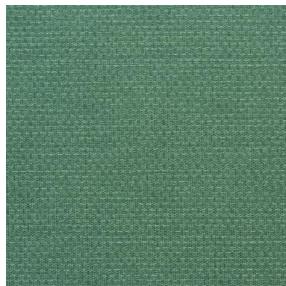
COMET OSIER 2300 Romarin 176