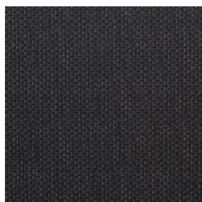
COMET OSIER 2300 Truffe 189