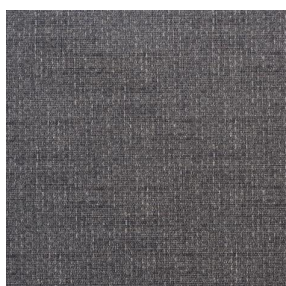
COMET OSIER 2300 Poivre 181