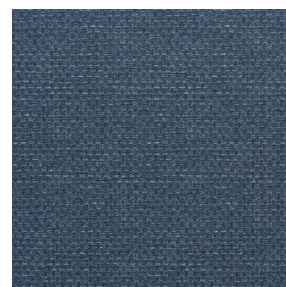
COMET OSIER 2300 Minéral 157