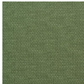
COMET OSIER 2300 Fenouil 177