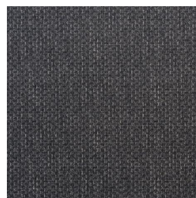
COMET OSIER 2300 Ardoise 87