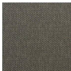
COMET OSIER 2300 Etain 180