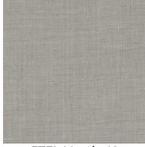
ETEL Mastic 48