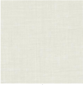
ETEL Blanc 01