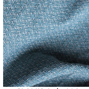
GLAMIS Jade 116