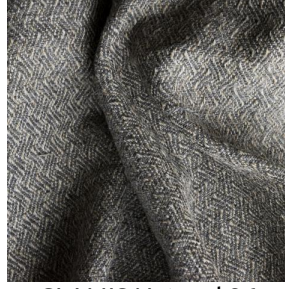
GLAMIS Naturel 26