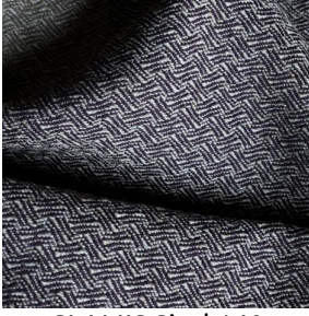
GLAMIS Sisal 140