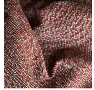
GLAMIS Châtaigne 55