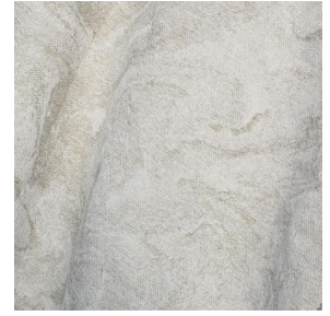
IMMERSION SIENTA Naturel 26