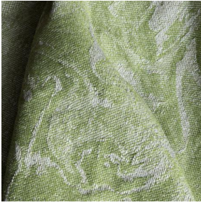
IMMERSION SIENTA Mousse 92