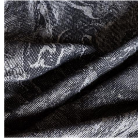
IMMERSION SIENTA Sisal 140