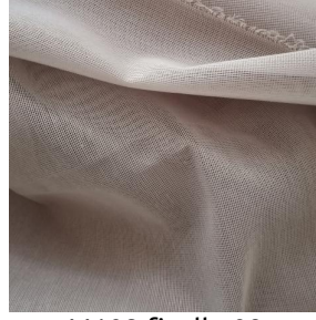
M102 ficelle 09