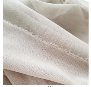
M102 lin 11