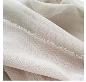
M102 lin 11