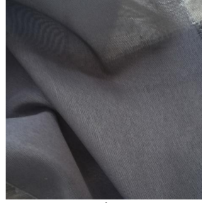
M102 anthracite 38