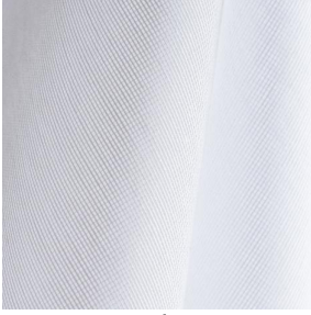
M102 Blanc 01