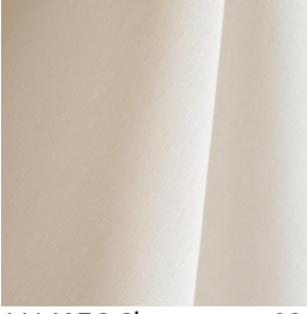
M140EC Champagne 02