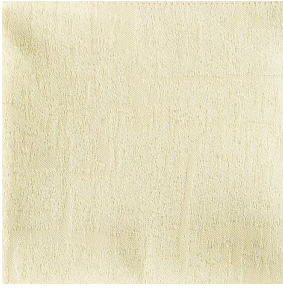
MERCURE Ivoire 01