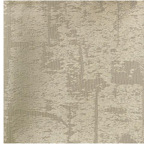
MERCURE Taupe 19