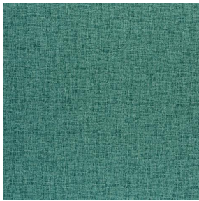
NOCLIN MURA 2334 Turquoise 53