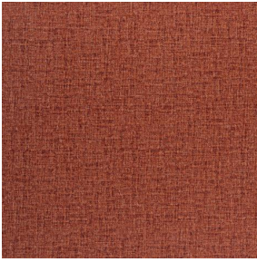
NOCLIN MURA 2334 Grenat 56