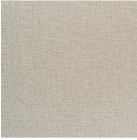
NOCLIN MURA 2334 Ivoire 115