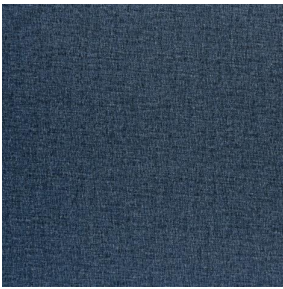
NOCLIN MURA 2334 Saphir 106