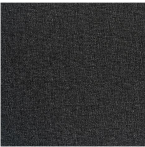
NOCLIN MURA 2334 Fusain 71