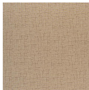
NOCTURNE MURA 2334 Dune 170