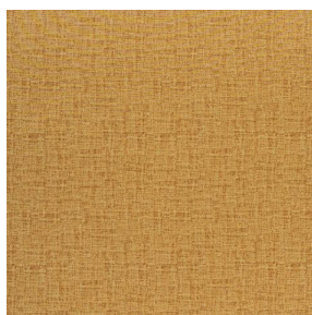
NOCTURNE MURA 2334 Savane 185