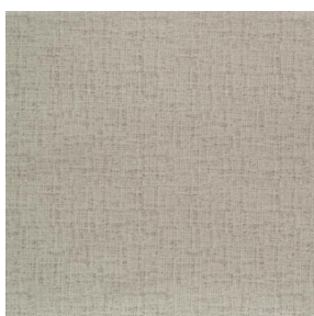
NOCTURNE MURA 2334 Ivoire 115