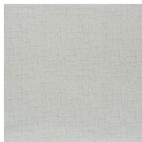
NOCTURNE MURA 2334 Mastic 48