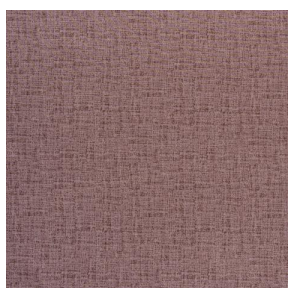
NOCTURNE MURA 2334 Terre 107