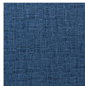
NOCTURNE MURA 2334 Saphir 106