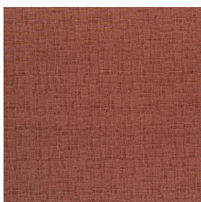
NOCTURNE MURA 2334 Grenat 56