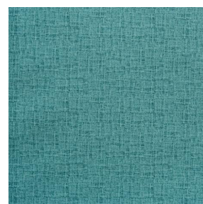
NOCTURNE MURA 2334 Turquoise 53