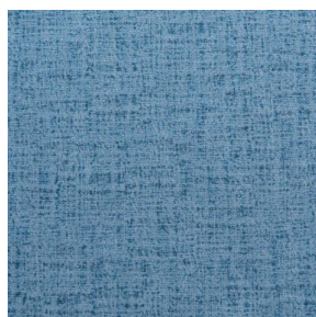
NOCTURNE MURA 2334 Glacier 43