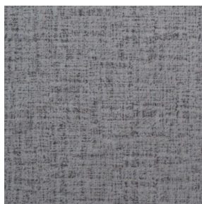
NOCTURNE MURA 2334 Minéral 157