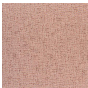
NOCTURNE MURA 2334 Rose 129