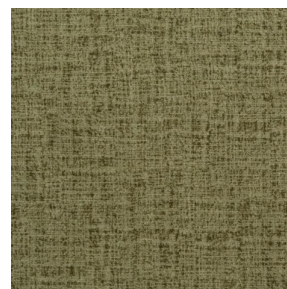
NOCTURNE MURA 2334 Olive 61