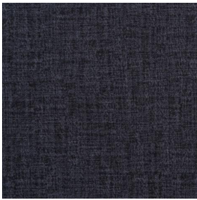
NOCTURNE MURA 2334 Noir 10