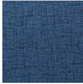
NOCTURNE MURA 2334 Saphir 106