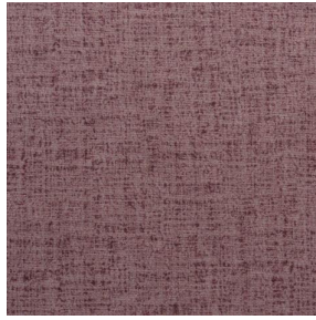
NOCTURNE MURA 2334 Rose 129