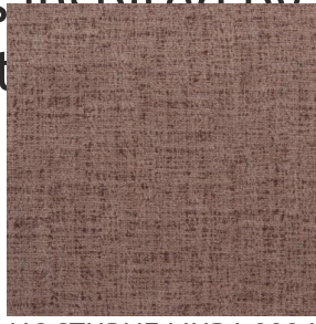
NOCTURNE MURA 2334 Dune 170