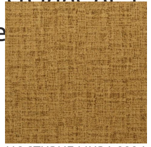
NOCTURNE MURA 2334 Savane 185