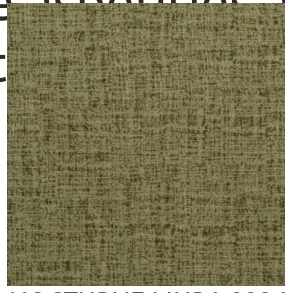
NOCTURNE MURA 2334 Olive 61