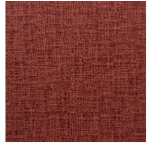
NOCTURNE MURA 2334 Grenat 56