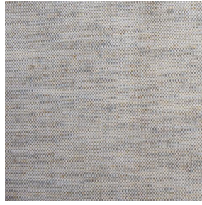
ROSO Taupe 24