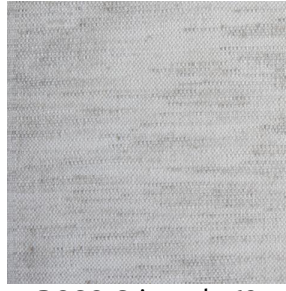
ROSO Gris perle 63