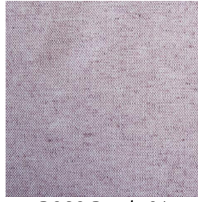
ROSO Purple 31