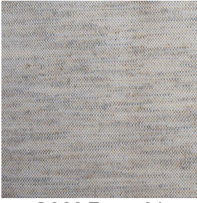
ROSO Taupe 24