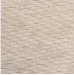
ROSO Lin 13