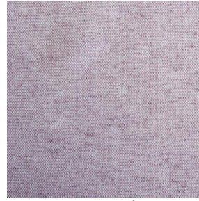
ROSO Purple 31