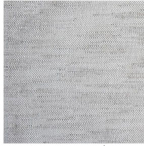
ROSO Gris perle 63