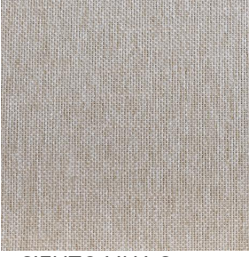
SIENTO LINA Savane 185