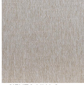
SIENTO LINA Savane 185