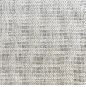
SIENTO LINA Dune 170