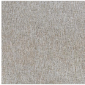
SIENTO LITO Lin 11