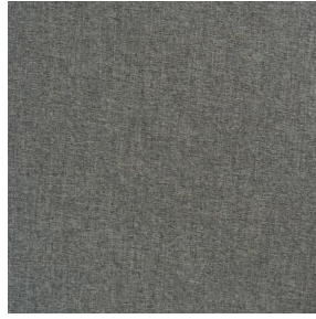
SIENTO LITO Taupe 95