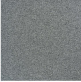
SIENTO LITO Souris 31