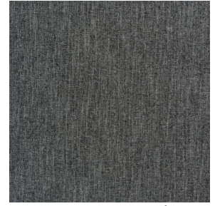
SIENTO LITO Cachou 159