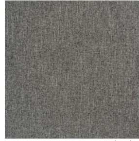
SIENTO LITO Minéral 157