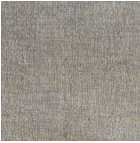
SIENTO LITO Cordage 172