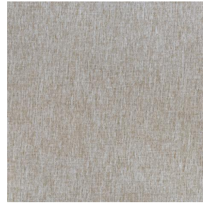
SIENTO LITO Lin 11