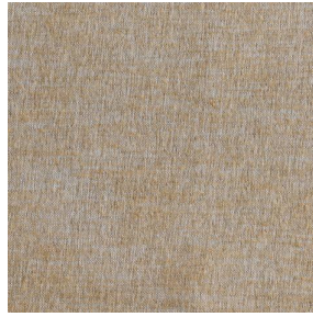
SIENTO LITO Sahara 169