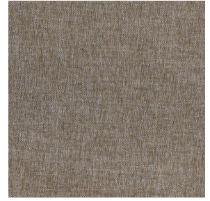
SIENTO LITO Brousse 192