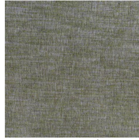
SIENTO LITO Lichen 156