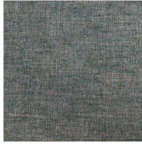
SIENTO LITO Poireau 162