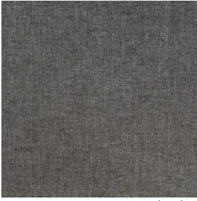
SIENTO LITO Minéral 157