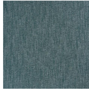
SIENTO LITO Sapin 126