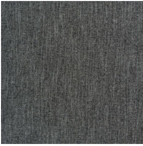
SIENTO LITO Cachou 159