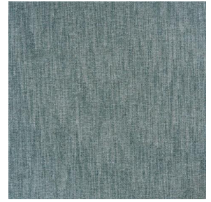
SIENTO LITO Poireau 162