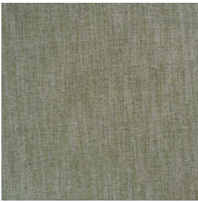
SIENTO LITO Lichen 156