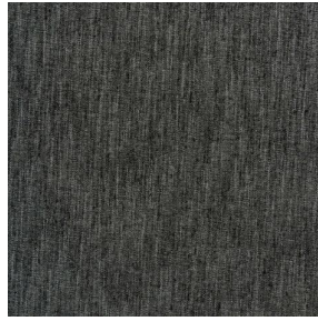
SIENTO LITO Poivre 181