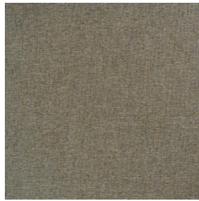
SIENTO LITO Cuivre 50