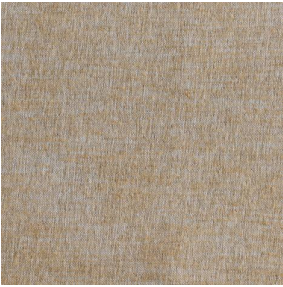
SIENTO LITO Sahara 169