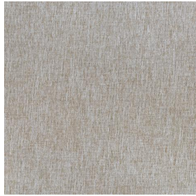
SIENTO LITO Lin 11