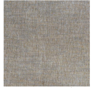
SIENTO LITO Cordage 172