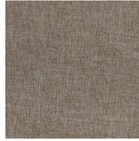
SIENTO LITO Brousse 192