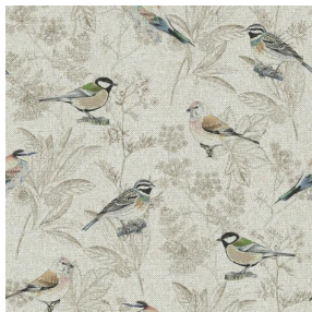
SIENTO RECYCLE DESSIN 2205 OISEAUX Naturel 26