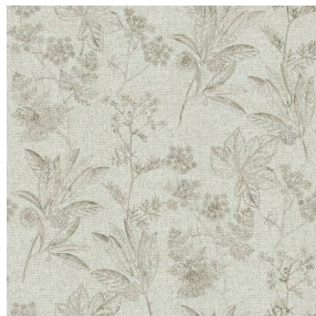
SIENTO RECYCLE DESSIN 2204 HERBIER Naturel 26