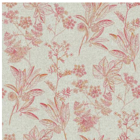
SIENTO RECYCLE DESSIN 2204 HERBIER Orange 15