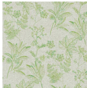
SIENTO RECYCLE DESSIN 2204 HERBIER Mousse 92