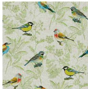
SIENTO RECYCLE DESSIN 2205 OISEAUX Mousse 92