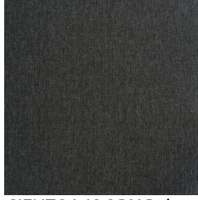
SIENTO WOODY Poivre 181