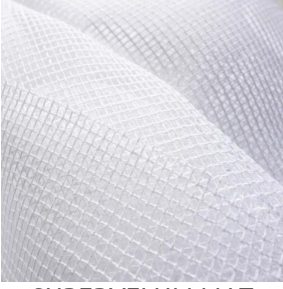
SUPERVELUM MAT Blanc 01