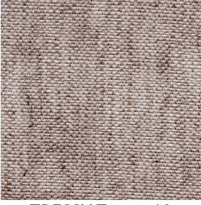
TRESSY Taupe 19