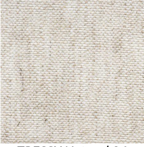
TRESSY Naturel 26