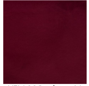
VELAOS Bordeaux 06