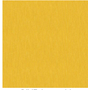
RIVE Jaune 46