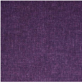
MUNA Saphir 106