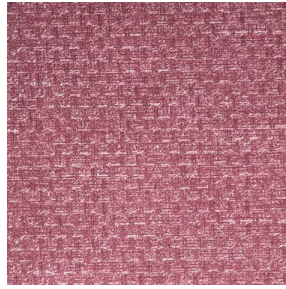
RUSTIC Hortensia 134