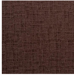
MURA TERRE 107