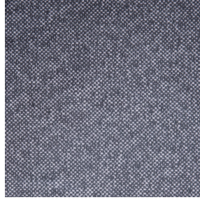
ANATOLE Taupe 95 Print pattern