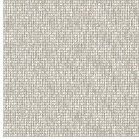
FLOT Sable 67 Print pattern