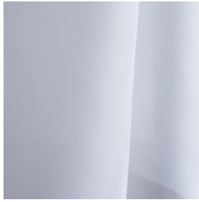
3141 bpi 00 Printing support