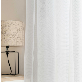
834S BLANC 01 Printing support