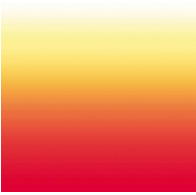
ZADIG Agrume 69