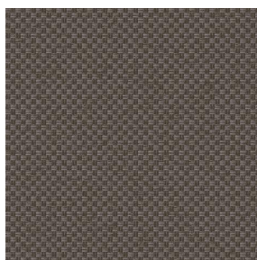
CHARLOTTE Terre 107