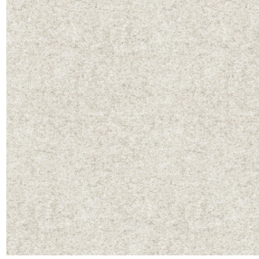
ELAINA Ivoire 115 Print pattern